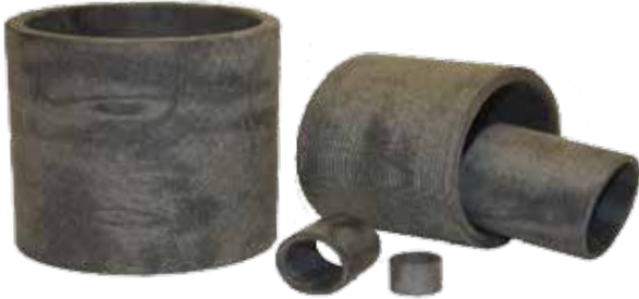
Sleeve Bearings Plain Bushings Journal Bearings

CIP Composites™ are manufactured as tubes and sheets then custom machined to a variety of different finished products.