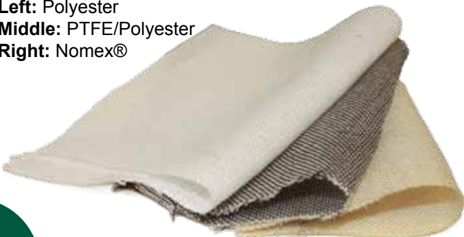
Left: Polyester Middle: PTFE/Polyester Right: Nomex®