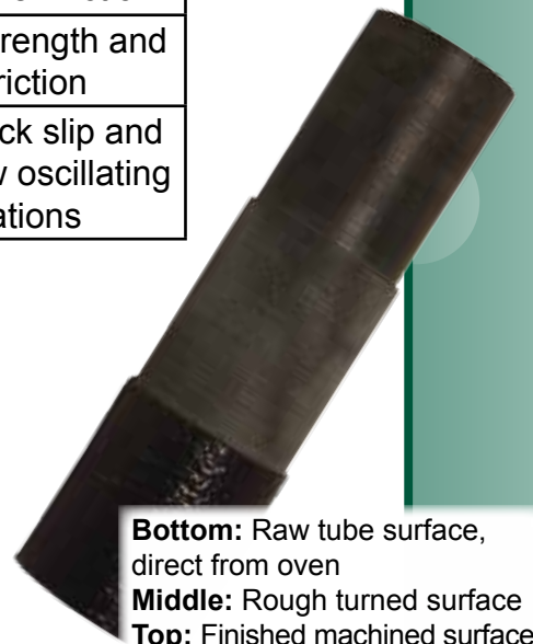
Bottom: Raw tube surface, direct from oven Middle: Rough turned surface Top: Finished machined surface