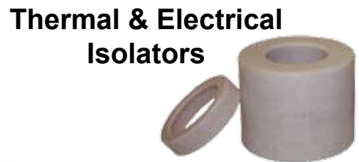
Thermal & Electrical Isolators