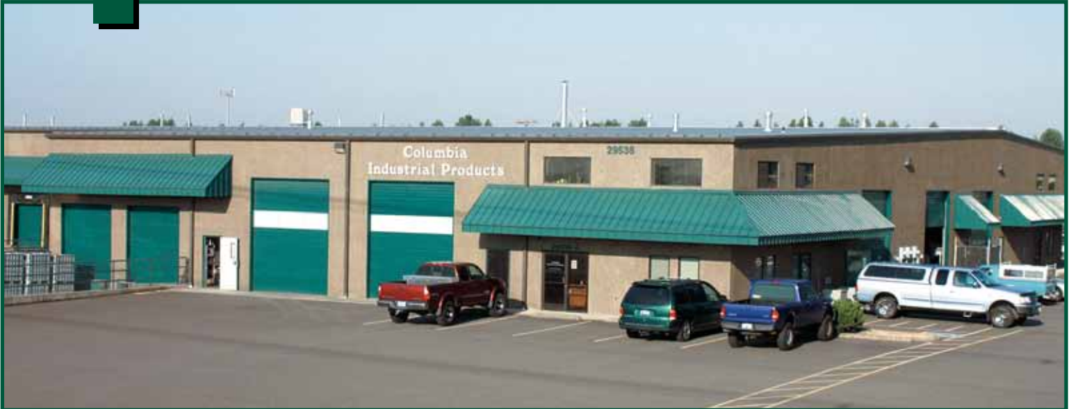
CIP HEADQUARTERS - EUGENE, OREGON USA

Columbia Industrial Products 29538 Airport Rd., Unit A - Eugene, Oregon 97402 Phone: 541-607-3655 - Fax: 541-607-3657 Toll Free: 888-999-1835 sales@cipcomposites.com www.cipcomposites.com